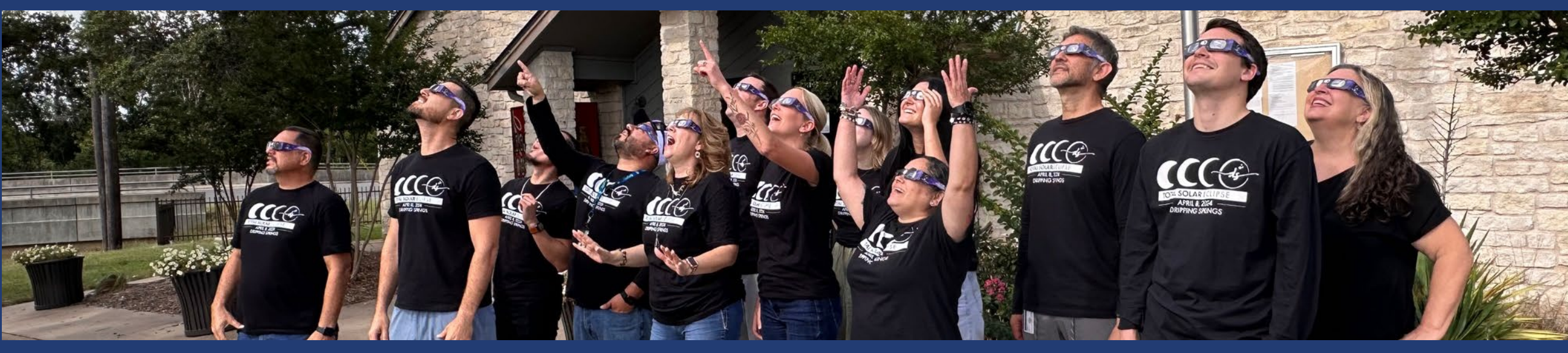
Town Hall Eclipse Meeting February 7, 2024